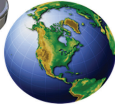
Ubiquitous network access