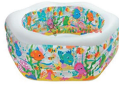
Location transparent resource pooling