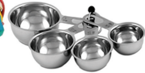
Measured service with pay per use